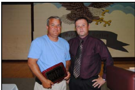
Booster Club Supporter of the Year Award went to